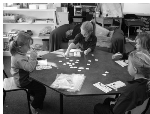
Playing the 'shopping' memory game